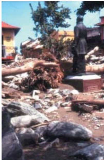
Effects on the urban heritage after La Guaira natural disaster, State of Vargas, Venezuela, December 1999

Under its Institutional Relations Programme, the Venezuelan Committee of ICOM devised a project in mid-2001 called "Emergency Brigades for Cultural Heritage". The general purpose of the project was to train qualified professionals for salvage activities permitting action and the retrieval and treatment of any cultural heritage items damaged by a variety of occurrences (earthquakes, seaquakes, flooding, volcanic eruptions, fire, terrorism or civil war). Carrying out preventive activity to counter such phenomena was one of the challenges of the project, seeking to develop skills for avoiding, delaying, preventing and/or detecting situations potentially threatening the country's cultural assets.