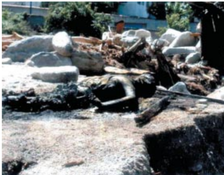
Effects on the urban heritage after La Guaira natural disaster, State of Vargas, Venezuela, December 1999

The torrential rainfall and subsequent flooding carried off the most emblematic museum in the area: Armando Reverón's El Castillete (small castle), the magic refuge of this exceptional Venezuelan, a painter of light. He built it as his dwelling place and workshop, furnished it and populated it with equipment and characters of his own artistic making and creative imagination. At the time of the tragedy, just a few of his works were kept in the museum together with others by prominent artists. In addition to El Castillete, the landslide carried off many liturgical objects, urban sculptures and thousands of personal objects representing the culture of La Guaira, an urban complex of historical importance; not to mention the lives, the skills and the memories that were also lost.